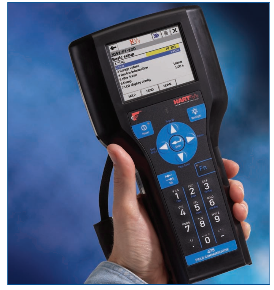
The 475 Field Communicator is designed to support all HART and FOUNDATION fieldbus devices from all vendors.