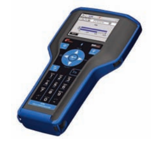
The protective rubber boot provides added protection in the field.

The 475 Field Communicator is designed, manufactured, and tested to very demanding specifications. It is ready to go wherever you need to go to get the job done.