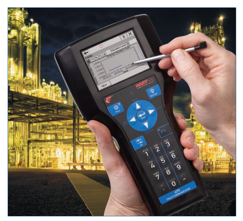
Designed not only for use on the bench, the 475 Field Communicator also enables you to do those tasks that just have to be done in the field.