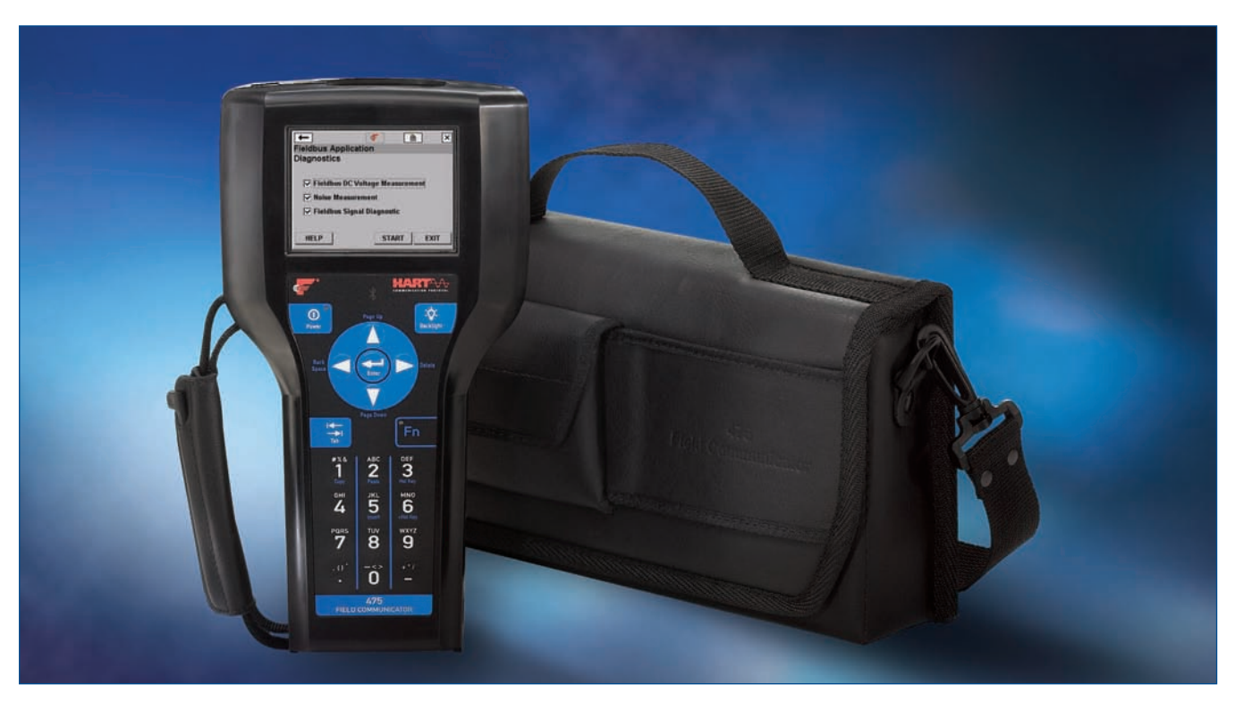
The 475 Field Communicator, with its handy carrying case, provides a single tool for configuring and diagnosing HART and FOUNDATION fieldbus devices.