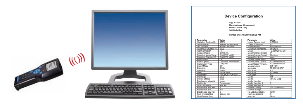
Easily store and print device configurations for analysis and documentation requirements.

Through Easy Upgrade , you always have access to the latest HART and fieldbus drivers. With the 475 Field Communicator, you are guaranteed universal HART and FOUNDATION fieldbus support in a single, intrinsically safe handheld communicator.